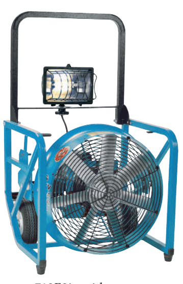
718E2i - with optional Light Kit