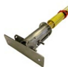
Sonar Search Frame