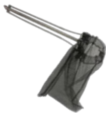
Retractable Rescue Net