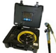
(Underwater) Inspection Camera