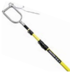
Standard Line Hook