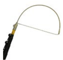
Pro Spring Snare Attachment